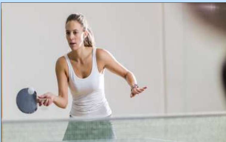
Table tennis is one of 40+ sports announced for the 2016 Jupiters Pan Pacific Masters Games held from 5 – 13 November on the beautiful Gold Coast.