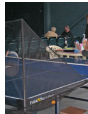
Action at the

Gatton table tennis club extends its thanks to TTQ for allocating funding to participate in this event.