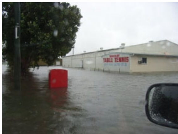
Table Tennis is bouncing back, despite Mackay's worst-ever flood.

The one-in-two-hundred-year event on Friday, February 15th 2008 put water 60 cm deep through the Bridge Road centre, which has housed scores of regional, state and national championships since its construction in the early 1970s.