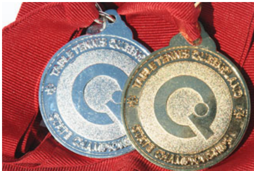
The new Table Tennis Queensland Medals

The club hopes to allocate extra funds to player development this year, particularly junior players, either through extra coaching or in sponsorship to play in tournaments.