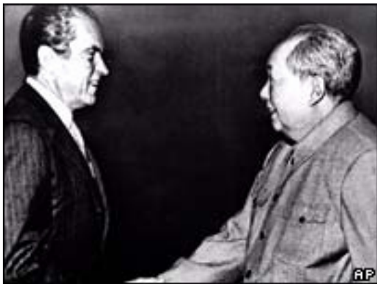
Richard Nixon meeting Mao Zedong in 1972

Our search for one of the original Chinese players takes us to a gym in Beijing. On a Saturday