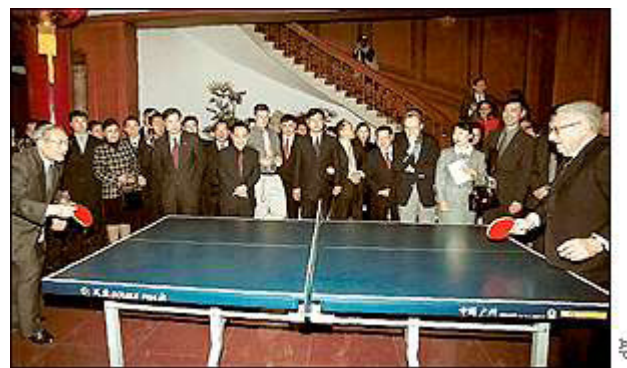
Henry Kissinger playing with Vice-Premier Li Lanqing