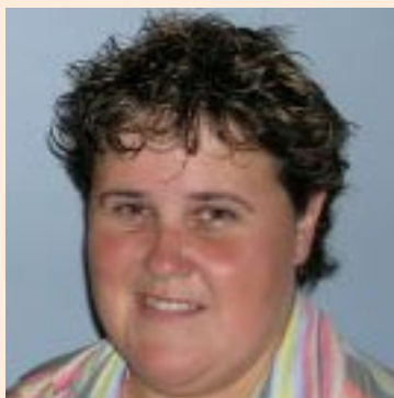
Table Tennis is a sport that can be enjoyed by people of all ages and all standards. Its appeal is that it can be played either socially or competitively.

As a TTQ board member she aims to enhance the representation of women on the board as well as highlight the needs of the northern part of our state.